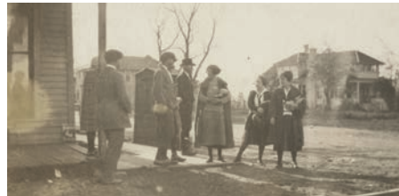
Gathered at Troy Corners 1923