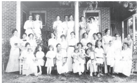
Troy Farmer's Club c. 1912

If you’re ready to reconnect or find a community of folks, please check out our extensive offerings this summer! From the Summer Kick-Off Open House, Strawberry Festival, and Garden Walk to Half-Day History and Yoga and more, there’s something for everyone!