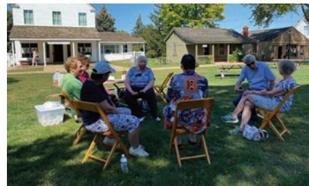
Village Volunteers gathered September 2021