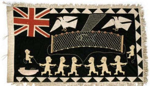
Asafo Flag, Detroit Institute of Arts, 1863

When you visit the Village this summer, you'll see an asafo flag on display as part of the Detroit Institute of Arts Inside|Out project. Created by an unknown Fante artist in Ghana in 1863, this asafo flag would have been commissioned by a military captain as part of his appointment. According to the DIA, asafo flags were displayed on special occasions, such as the royal yam festival and funerals. Asafo flag imagery was sometimes used to insult rival military companies!